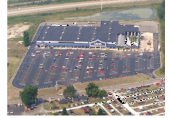
Lowe's ALTA Survey Wheelersburg, Ohio

Construction Staking and Quality Control of foundations on $85 Million Phenol III Plant for Morrison Knudson at the Sunco (Aristech) Haverhill Plant, Eastern Scioto County, Ohio