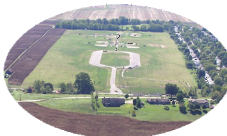
City of Waverly Park & Armbruster Drive Design Waverly, Ohio