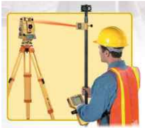
Topcon 820 Robotics

APX survey field personnel can collect a large quantity of data in a short time period using our robotics survey equipment. With our prism-less equipment we can collect field data in inaccessible areas.