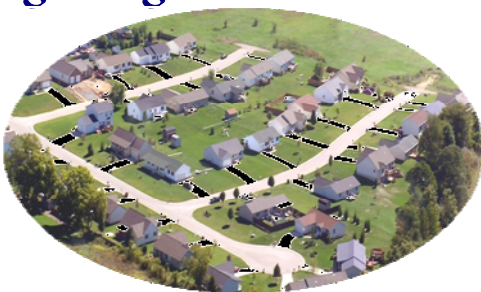
Sherman Heights Subdivision Design (150 Lots) Chillicothe, Ohio