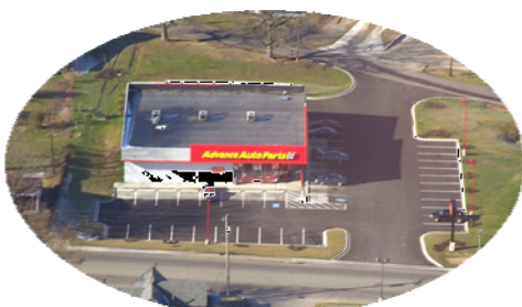
Advance Auto Parts Site Design Jackson, Ohio