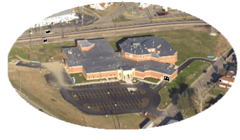
Scioto County Jail Site Design Portsmouth, Ohio