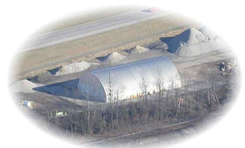
Scioto County Engineer Wheelersburg Outpost Salt Shed Design