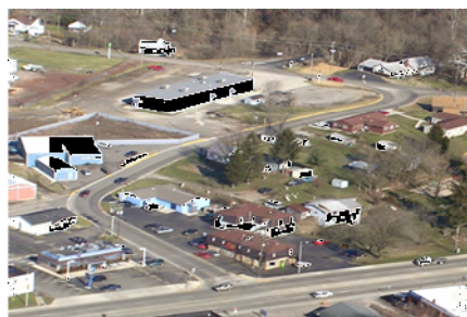
Ford Avenue Reconstruction Waverly, Ohio