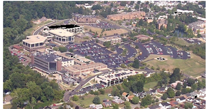
SOMC Site Survey for Facilities Plan Portsmouth, Ohio