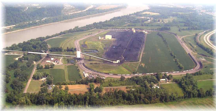
Norfolk Southern Wheelersburg Coal Terminal Boundary & Topographic Survey - Wheelersburg, Ohio

Seamless transfer of collected field data using Bluetooth technology